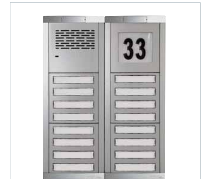
2 Modules mounting system detail.