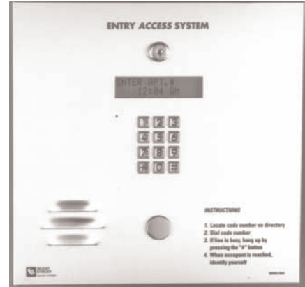
5083 Hands-free Entry System

The 5076 heater kit can be used with the 5083/84 entry systems. It is designed to maintain the temperature inside the cabinet above 32° F when the outside temperature is as low as -20° F. The heater uses a self-regulating PTC (Positive Temperature Coefficient) material for the heating element. The heater is powered by a 16.5 VAC 40 VA Class 2 transformer. Connections are made to the heater using a two position terminal strip. The heater bracket is electrically insulated from the heater element. The 5076 measures 5-1/2" H x 4" W x 1/2" T (12.83 cm x 10.16 cm x 12 mm)